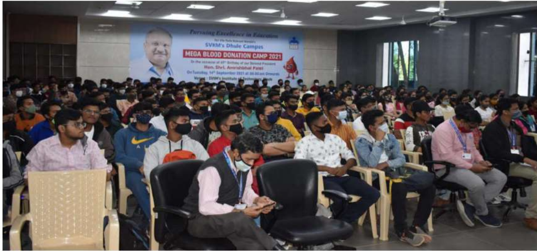
Students present for session