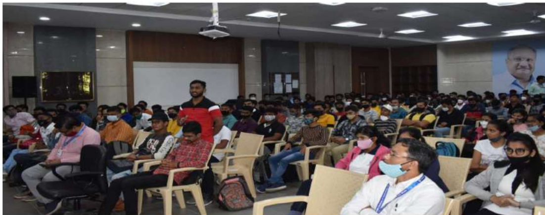
Student participation in interactive session

Interactive Session: The lecture was followed by an engaging Q&A session, where students actively participated, seeking further clarification and sharing their reflections. This interaction facilitated a deeper understanding of the topics discussed.